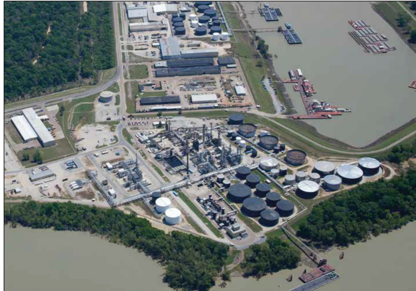
Ergon refinery in Vicksburg, Mississippi, USA